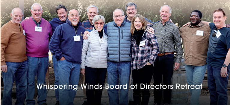
Whispering Winds Board of Directors Retreat