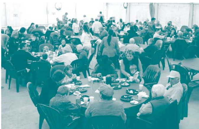
Thanksgiving dinner at Whispering Winds