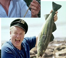
Gilligan - Sloth