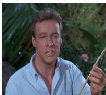
The Professor - Wrath

I have fallen in love with the knowledge of the seven deadly sins. I find that I have a favorite sin that I return to over and over. If I don't see my actions for what they are, then I can romance the sin, pretending that it is a virtue. Keeping the seven deadly sins in mind, really helps me to see if my sin of choice is coming to life again with a new color of lip stick on so I won't recognize it. I use the Gilligan Island characters to remind me of the seven deadly horsemen: