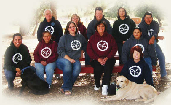
STAFF FOR ALL SEASONS